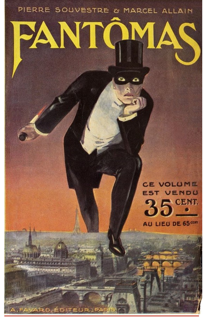
Cover of the first volume of the Fantômas series by Pierre Souvestre and Marcel Allain, 1911. Illustrator unknown.