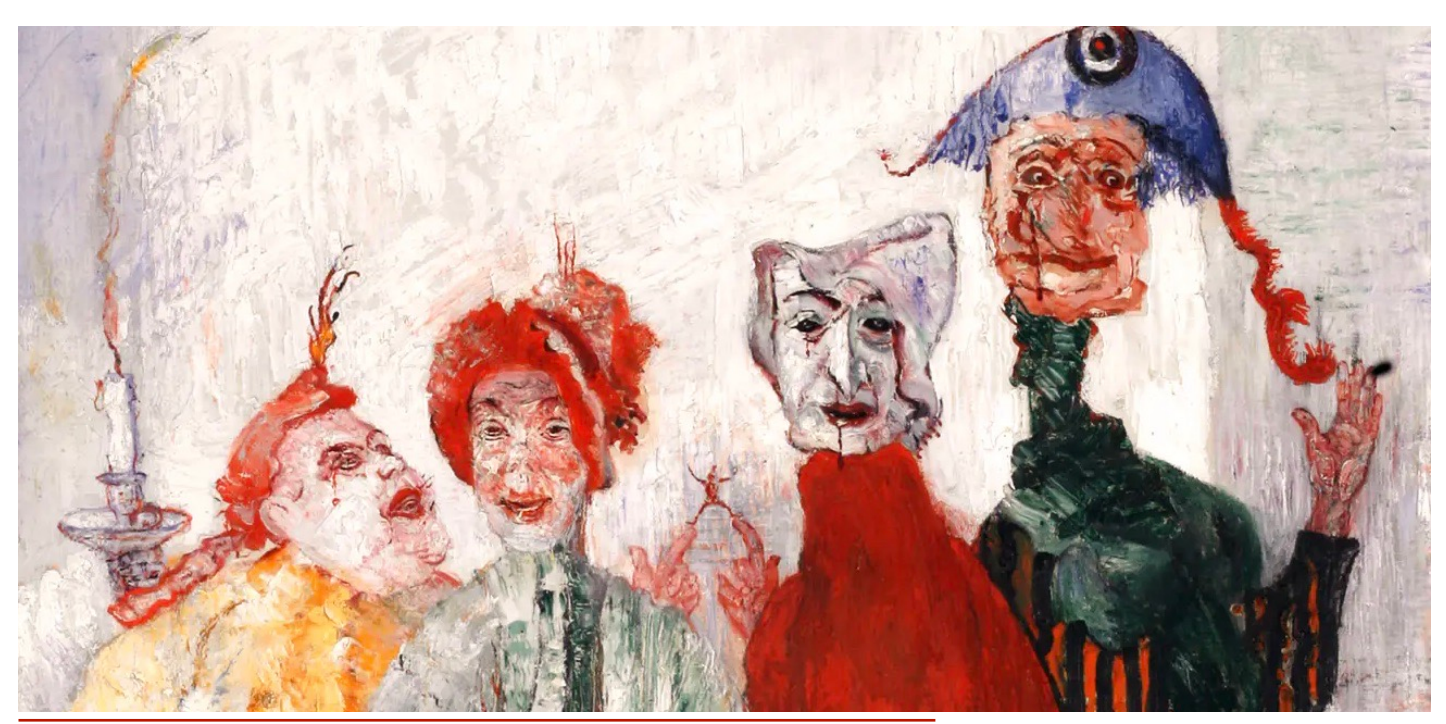
James Ensore, "The Strange Masks" (1892, detail)