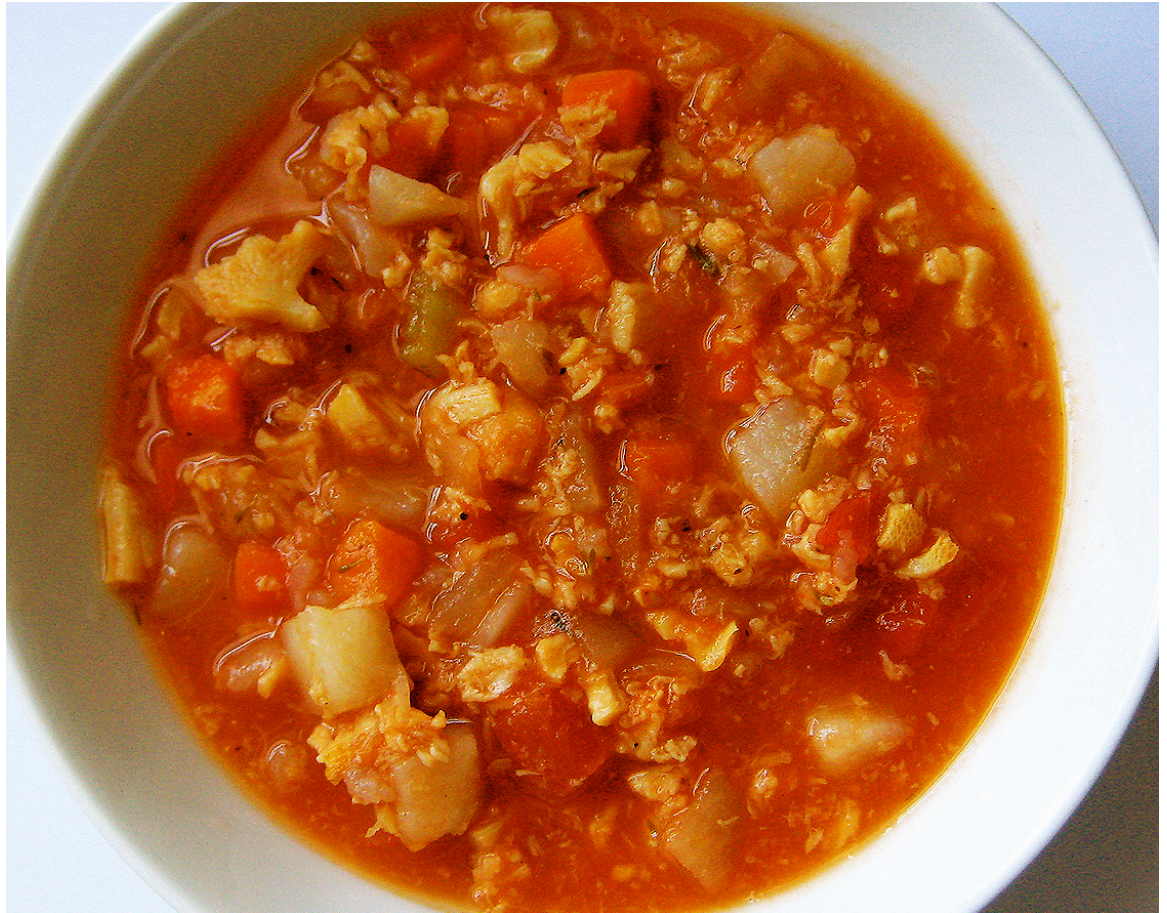
At right: "Clam Chowder in White Bowl, June 19, 2008"

The Babbington Press and all its Publications are pieces of one fiction: The Personal History, Adventures, Experiences & Observations of Peter Leroy.