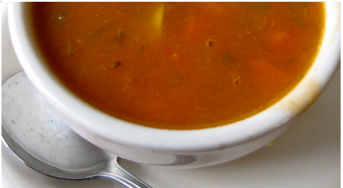
“Clam Chowder in White Bowl with Spoon, April 18, 2010”