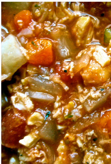
Far right: “Clam Chowder in White Bowl, December 3, 2008”