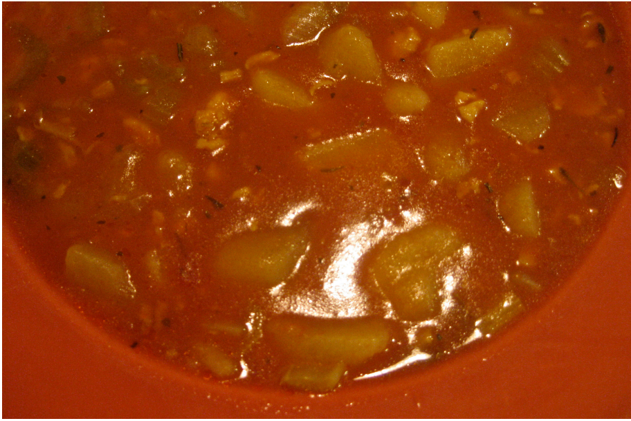
“Clam Chowder in Red Bowl, May 29, 2009”

allow for understanding the world and myself in it. However, to make the task a little more significant, or challenging, or worthy, I’m adding the making of a self, my self. I think that making a self will turn out to be a daily undertaking, like making the day’s dinner, but it will have a larger ultimate goal than the making of a day’s dinner, or even making the day’s dinner as well as it can be made—at least I assume that it will.