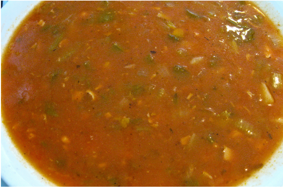
“Clam Chowder in White Bowl, February 13, 2010”

the celery, but at about the same angle.